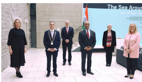
Ambassador with Sligo County leadership