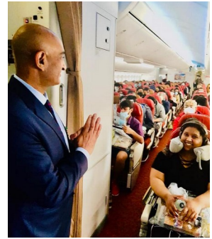
The Ambassador wished safe flight to all passengers

3. Organisation of second “Vande Bharat Mission” Special Repatriation Flight: The second Air India repatriation flight to take back Indian citizens, comprising of stranded tourists, the elderly, pregnant women, people with medical emergencies, students and seafarers left on 03 June for New Delhi and Mumbai. Around 250 citizens were transported home. (The first repatriation flight was organised on 26 May). These flights are also being used to bring Indian and Irish citizens from India to Ireland, including Indian nurses who have been offered frontline positions in medical institutions throughout Ireland. The Embassy will also continue working for institutionalization of direct flights between India and Ireland which will provide a spur to business and tourism.