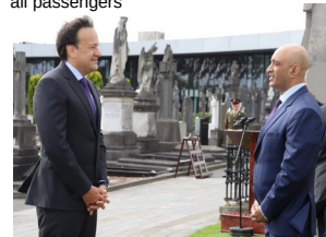
Wreath-laying ceremony; Ambassador with Tánaiste L. Varadkar T.D.

4. Irish Commemoration of the centenary of the Connaught Rangers Rebellion in India: Ambassador participated at a wreath-laying ceremony (28 June) led by Deputy PM Leo Varadkar. in Glasnevin Cemetery, Dublin to commemorate centenary of Connaught Rangers Mutiny, one of the most extraordinary acts of defiance against the British Empire in India on 28 June 1920 when four Irish soldiers, members of the British army, protested against the suppression of the independence movement in Ireland. Event marks poignant linkage between the Indian and Irish freedom struggle movements. This was the first official duty of Mr. Varadkar as Deputy PM after the formation of the new coalition government the previous day.